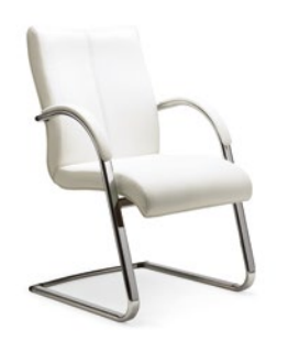
256 Cantilever with standard upholstered shell