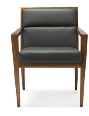
314 Standard Armchair