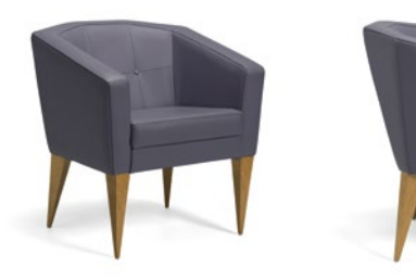
303 Timber legs available in Walnut, Oak, Beech and Ash