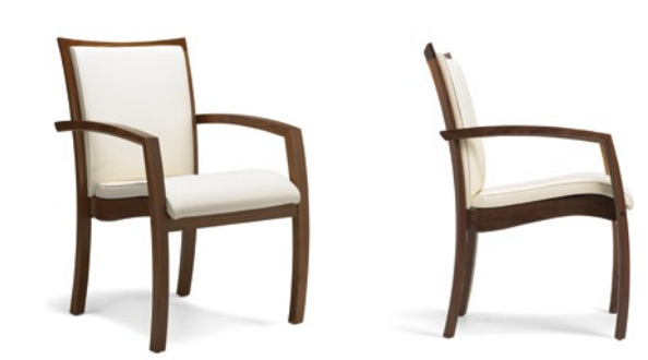
361 K Stacking Armchair

Why CHANGE? Because sometimes you'll need that meeting room for another function, be it for a conference or a stand up function. CHANGE offers all the elegance of a classic boardroom chair with excellent levels of sitting comfort and the functionality of a comparatively lightweight timber stacking chair, enabling quick and easy clearance. Made from the highest grade solid timbers (guaranteed by independent audit to be from fully sustainable sources) it is available in a number of species including Walnut, Oak, Ash and Beech, that can be stained to colour if required.