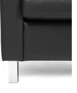
LIBRA DOUBLE O & SIXTY