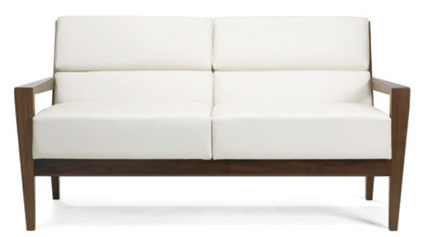
392 Lounge Two Seater