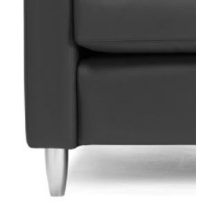
Polished Aluminium Conical Leg