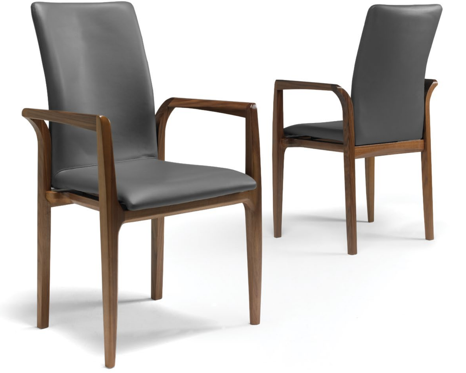
Stacking Armchair with solid Walnut frame