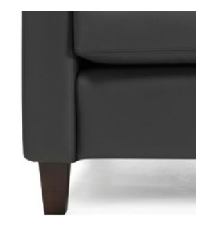
Solid Timber Conical Leg Polished Wood Tapered Leg

FSC® Trademark ©1996 Forest Stewardship Council® A.C. Certificate Reg. No. TT-COC-001739