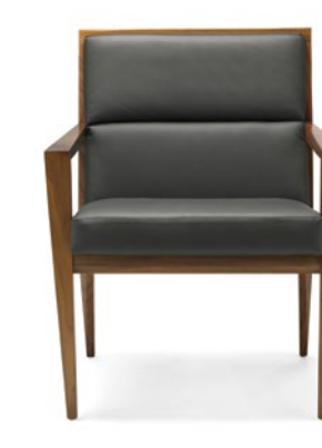
311 Spacious Armchair

The chairs are available in two sizes. The standard version is a very comfortable solution and more than adequate for use as a visitor or boardroom chair in the majority of installations, however the "spacious" version has been designed specifically where a more generous sit is required and room is available.